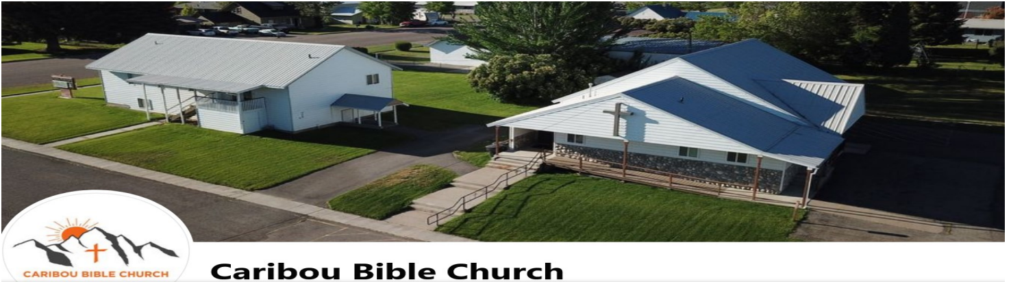
Caribou Bible Church